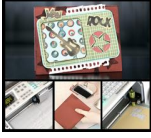
You Rock Card