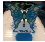
Butterfly Display card