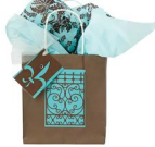
Gate Gift Bag