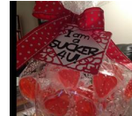
Valentines Sucker Gift Basket