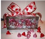
Hugs & Kisses Glass Block