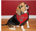
Valentine Doggie Bandana