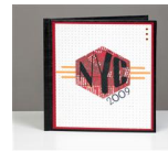
NYC 2009 Mini Album