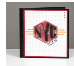
NYC 2009 Mini Album