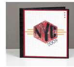
NYC 2009 Mini Album