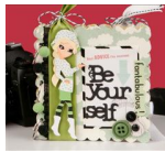
Be Yourself Mini Album