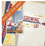
Growing Up Layout