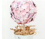
Mother's Day Centerpiece