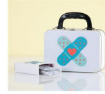
Dr. Checkup First Aid Box