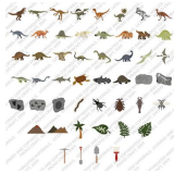
Cricut® Dinosaur Tracks Cartridge