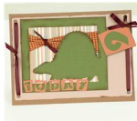
"6 Today" Card