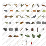
Cricut® Dinosaur Tracks Cartridge