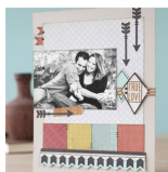
True Love Layout