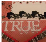
You are my True Love