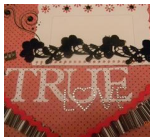
You are my True Love