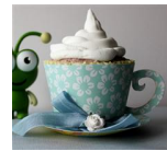
Tea Cup Cupcake Holder