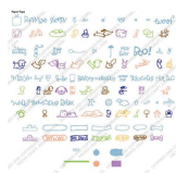
Paper Pups Cartridge