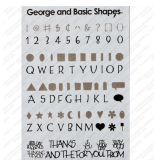
Cricut® George and Basic Shapes Cartridge