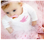
Bird Baby Sleeper