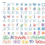
Cricut® Doodletype Cartridge