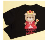
Queen of Hearts T-shirt