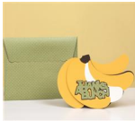
Thanks A Bunch Card