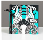
Thanks Designer Card