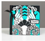
Thanks Designer Card