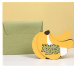
Thanks A Bunch Card