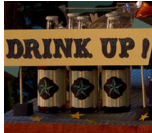
Drink Up Sign