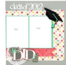
Class of 2012: You did it! Layout