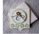
Baby Bottle Card