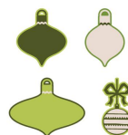
Christmas Ornaments Digital Set