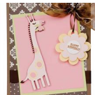
Happy Birthday Card - Giraffe