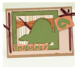
"6 Today" Card