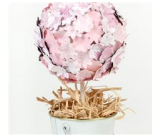
Mother's Day Centerpiece