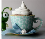
Tea Cup Cupcake Holder