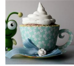
Tea Cup Cupcake Holder