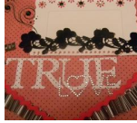
You are my True Love