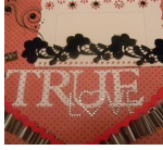
You are my True Love