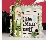
Be Yourself Mini Album