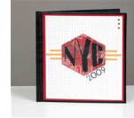
NYC 2009 Mini Album