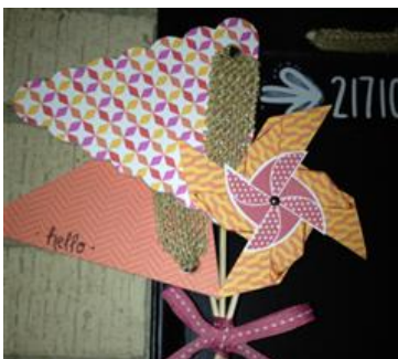
Close up of banners and pinwheel

Cover chipboard mini banner with cuts from the Cricut Close to My Heart Art Philosophy Cartridge. The pieces should match the chipboard perfectly cut at 4". Thread burlap ribbon through holes on each banner and hot glue the banner to the bamboo skewers. Add the word "hello" to one of the banners using a black fine tip marker.