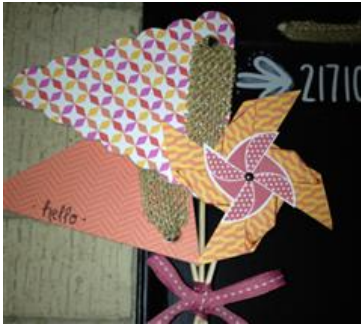
Close up of banners and pinwheel

(I had to trim this bamboo skewer down to have the pinwheel placed where it is. Very carefully cut)