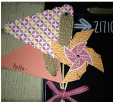
Close up of banners and pinwheel

Wrap Hollyhock (hot pink) Stitched Ribbon around intersection of bamboo skewers, tying a bow. Secure with hot glue to ensure it does not come untied.