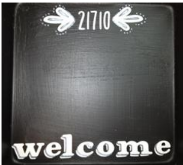
Progress Photo- add shadows using chalk marker

Using the chalk marker, add shadows and embellish around vinyl as desired. This will create more of a chalk feel to the words.