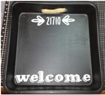
Progress Photo- Attach Vinyl

Cut Cricut Craft Room (CCR) File using the Cricut Chalkboard Font Cartridge and white vinyl. This top number is my house number, as I will be displaying on my front porch- be sure to change the number in the CCR file before you cut! Apply transfer tape and once the chalkboard paint is dry apply to the surface of the pan.