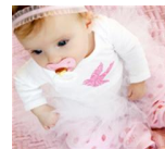
Bird Baby Sleeper