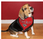
Valentine Doggie Bandana