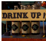
Drink Up Sign