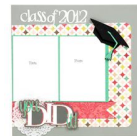
Class of 2012: You did it! Layout