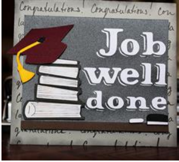
chalkboard font card

Embellish as desired, adding detail touches that work with the colors you use.