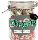
Congrats Smartie Pants Treat Jar