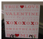
Word Collage Boards