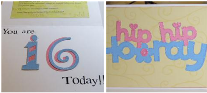
Front of card

I used a premade scored white cardstock card and using scrapbook paper to cover the front. The just cut out the hip hip hooray from the Create a Critter Cartridge and the 16 from the Celebrations cartridge. I used Stickle on the front to give it some sparkle, and used rub on black letters for lettering. Then I typed out a personal message and adhered it to the top.