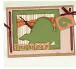
"6 Today" Card