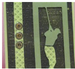
Masculine Birthday Card