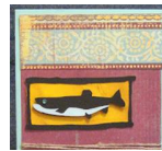
Father's Day Card