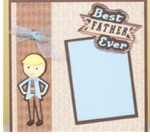
Best Father Ever layout