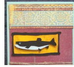
Father's Day Card