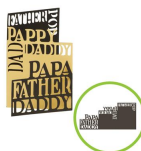
Father's Day Card Papa