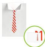
Father's Day Card Sunday Best