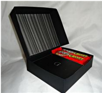
It fits a wallet and 4 chocolate bars :)

Using tape, glue the foil to the back of the patterned paper and then glue to inside of lid, using fold lines as reference.