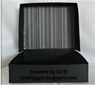
inside of the box

using the CCR file above place your cardstock on a 24" mat and cut. Fold the sides of your box