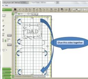
Glue this sections to create the top and bottom sections and then join them