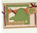
'6 Today' Card