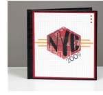
NYC 2009 Mini Album