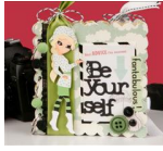
Be Yourself Mini Album