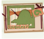
"6 Today" Card