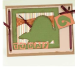
"6 Today" Card