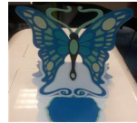
Butterfly Display card