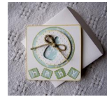
Baby Bottle Card