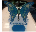
Butterfly Display card