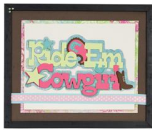
Ride 'Em Cowgirl Frame