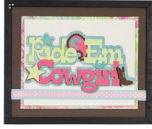
Ride 'Em Cowgirl Frame