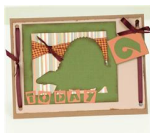
'6 Today' Card