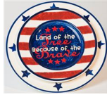
Land of the Free Plate