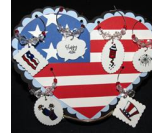
Fourth of July Glass Charms