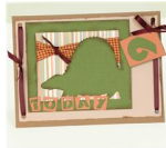
"6 Today" Card