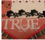
You are my True Love