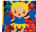
Gum Ball Jar