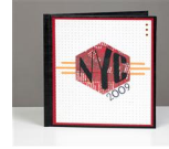
NYC 2009 Mini Album