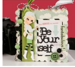
Be Yourself Mini Album